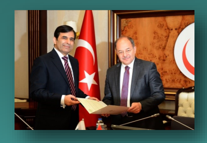
Delegation of Punjab State, Pakistan Visited Turkey

"Grant Agreement in the Field of Health between Government of Republic of Turkey and Government of Republic of Yemen" was Signed